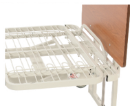
4" Bed Extender