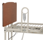
Pivoting Assist Bars