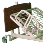
1/4 Length Side Rail