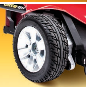
BLACK, FLAT-FREE NON-MARKING TIRES