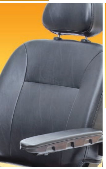
COMFORT HIGH-BACK SEAT WITH HEADREST