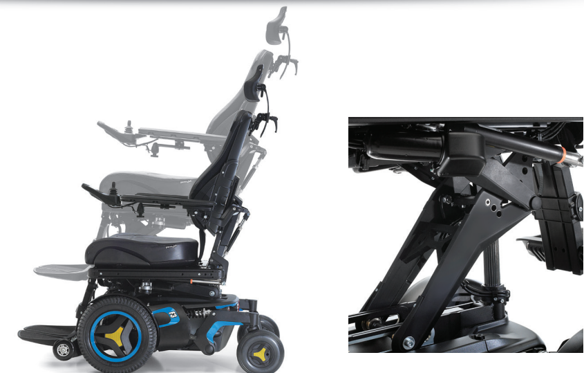
12" seat elevator that maintains three-points of contact for increased stability