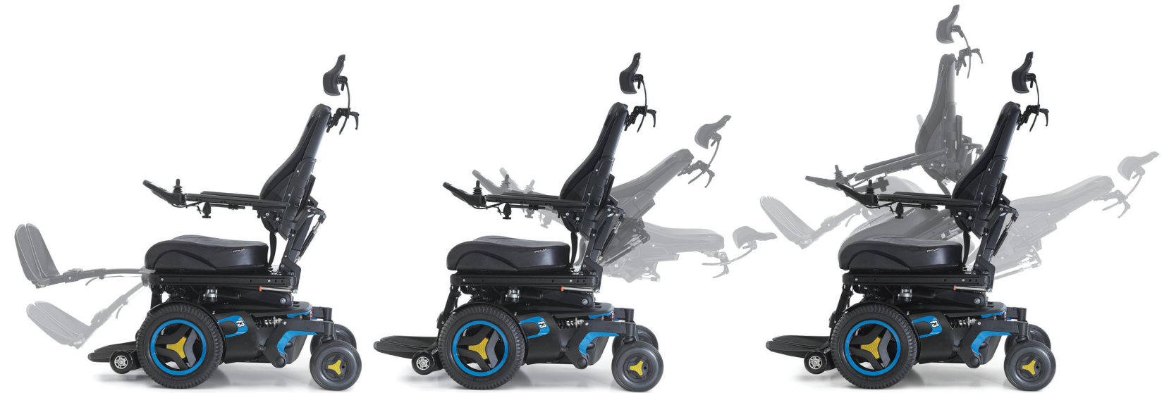
All things Corpus power features like elevating legrests 85° - 170°