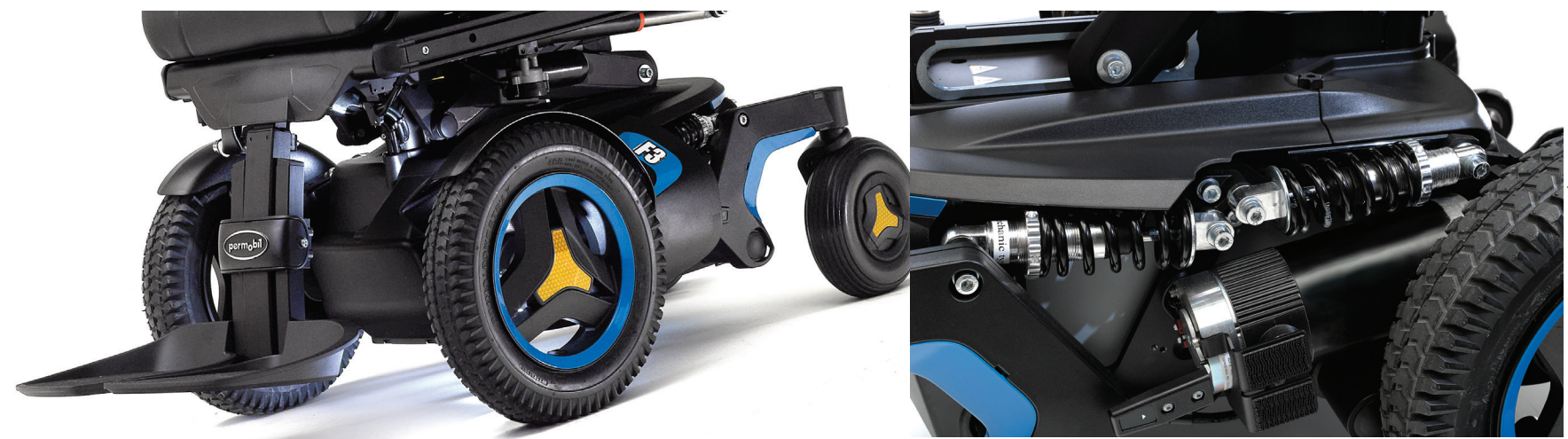
Compact maneuverability with an option to remove anti-tippers