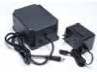
Battery Backup 999-0831-003 Charger 999-0711-002

USB Power Supply eliminates using a separate wall outlet for cell phone and tablet charging ZA90020