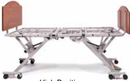
High Position Height Travel Range: 30"