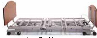
Low Position Height Travel Range: 7"