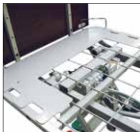
Length Extension Kit ZA90500 4" extension ZA90400 8" extension