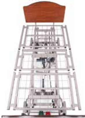
Pin-on Wide Kit ZA858000 39" extension ZA851000 42" extension