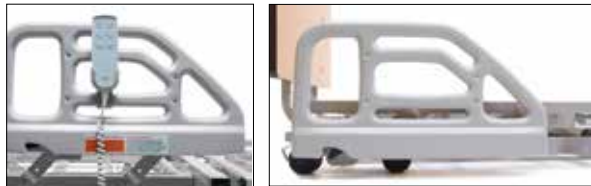
Counter-rotating Assist Device ZA84200 US Patent-awarded counter-rotating assist device