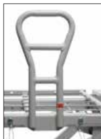
Fixed Assist Device ZA85000