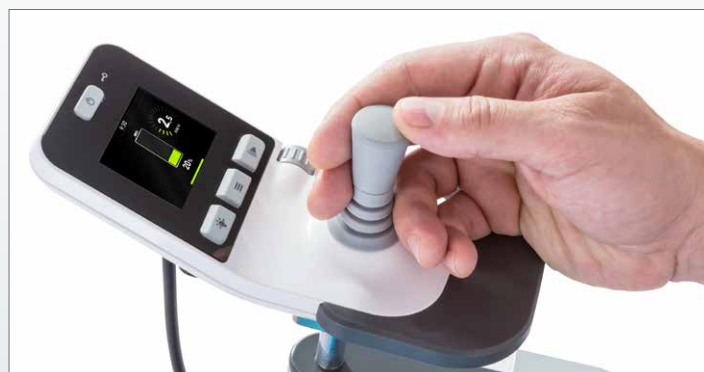
Informative colour display and user-friendly control elements