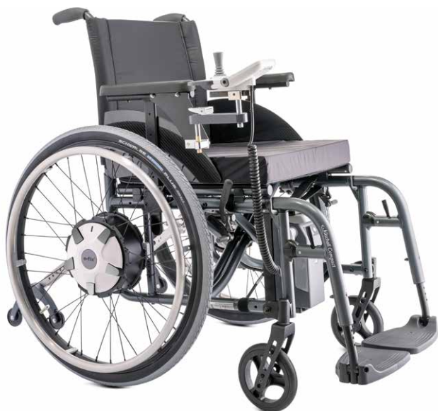
e-fix E36: powerful drive wheels with more power (optional)