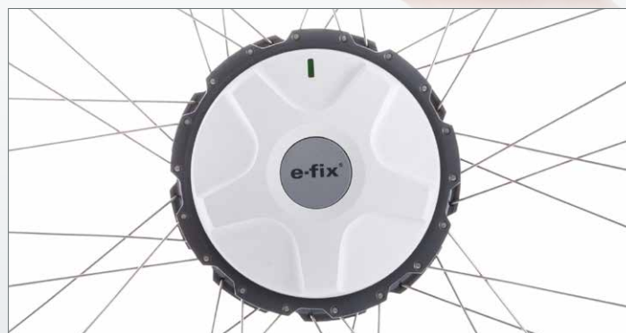
Compact, light, powerful: the e-fix drive unit