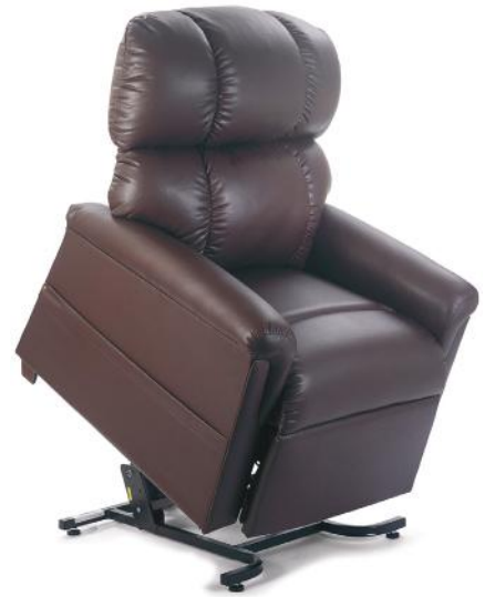
PR535M shown in Brisa Coffee Bean