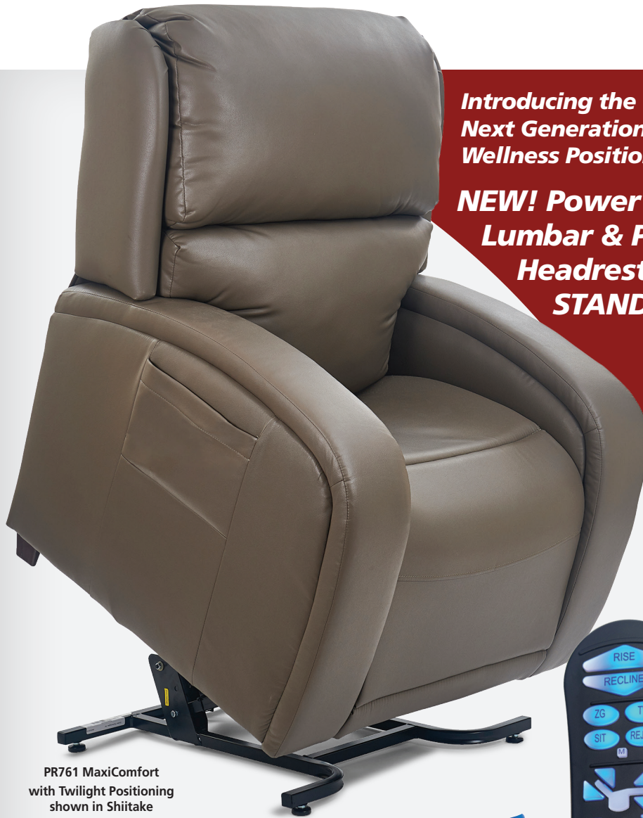
PR761 MaxiComfort with Twilight Positioning shown in Shiitake

Introducing the Next Generation of Wellness Positioning