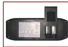
Battery Backup System

Battery Backup System Batteries not included. Battery Backup System is designed to bring the chair from the reclined to the seated position in the event of a power outage.