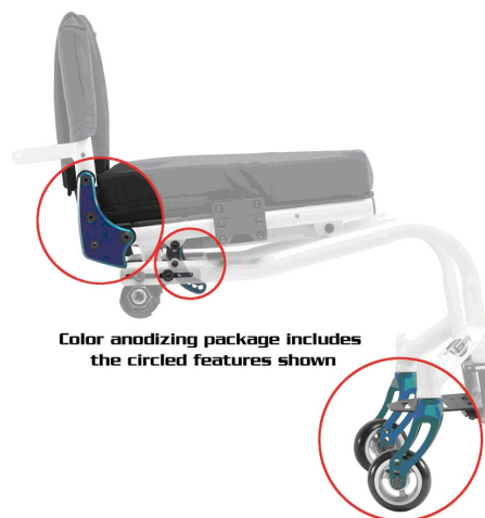
Color anodizing package includes the circled features shown