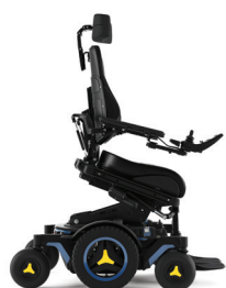
Anterior tilt adjustment