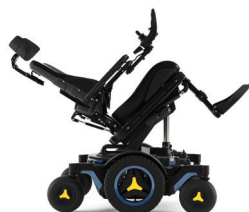
Posterior tilt adjustment