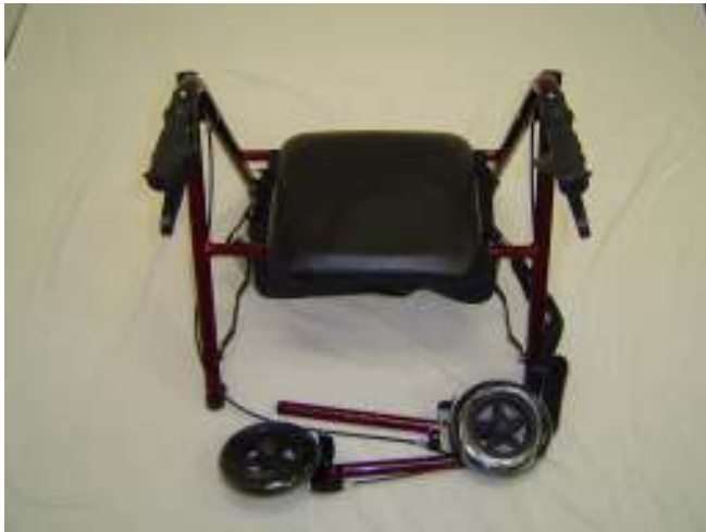
1 Rollator Frame + Rear Wheels (attached)