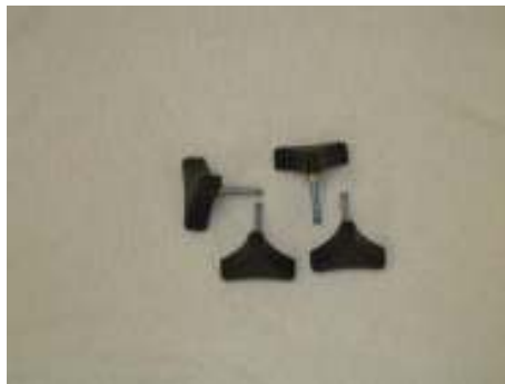
4 Triangular Hand Screws