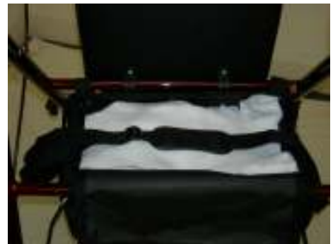
1 Vinyl Bag