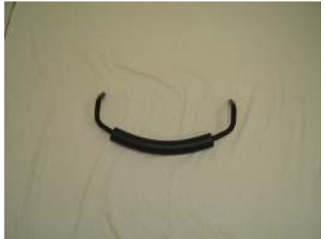
1 Backrest with Pushbuttons