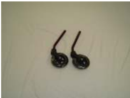
2 Front Wheels