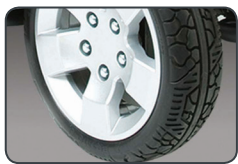
13" Low-profile Tires