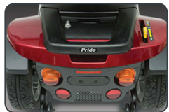
Full Lighting Package

The Pursuit ® incorporates a blend of power, style and performance to handle rugged outdoor terrain. The powerful drivetrain, 24 Volt, 4-pole motor for increased power, 3.56" ground clearance and maximum speed of 8 mph combine power and torque to accelerate your active lifestyle. Standard features include feather touch disassembly, wraparound delta tiller, 13" low-profile solid tires, front and rear suspension, high-back reclining seat, full lighting package, infinitely-adjustable tiller, front basket and rearview mirror. Available in Red and Silver.