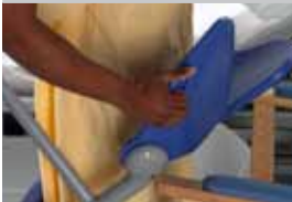
New Seat Design

The innovative pivoting seat improves transfer efficiency and resident/patient stability