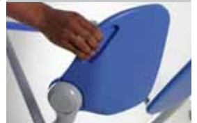
Built-in Seat Hand grips

Hand grips integrated in the seat allow the caregiver to easily turn the support aid