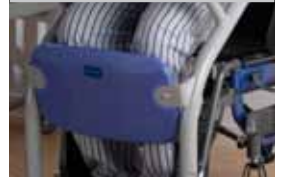
Better Knee Support

Provides extra stability and firm support when a resident/patient cannot fully control leg movements