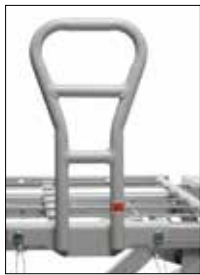
Fixed Assist Device ZA85000