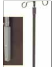
Board Mounted IV Socket ZA19000