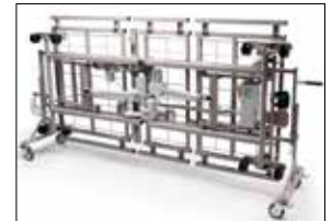
Zenith/Matrix Bed Cart ZA89900

Embedded staff control with safety-inspired two-stage lockouts enables caregivers to lock-out individual features to the resident