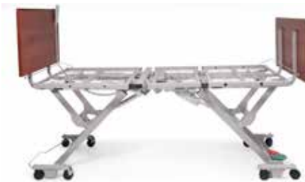
High Position Height Travel Range: 30"