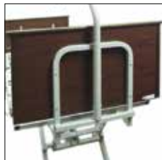
Trapeze Adapter (mount) ZA79000

Battery Backup 999-0831-003 Charger 999-0711-002