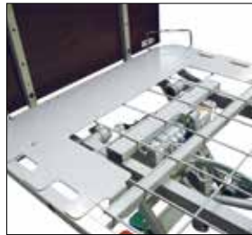
Length Extension Kit ZA90500 4" extension ZA90400 8" extension