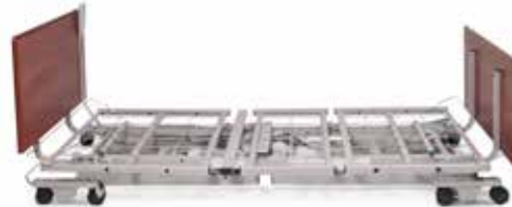
Low Position Height Travel Range: 7.95"