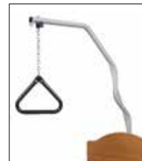
Trapeze (bar chain, triangle) ZA78100