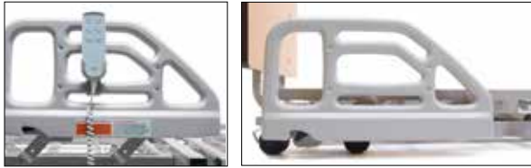
Counter-rotating Assist Device ZA84200 US Patent-awarded counter-rotating assist device