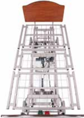
Pin-on Wide Kit ZA858000 39" extension ZA851000 42" extension