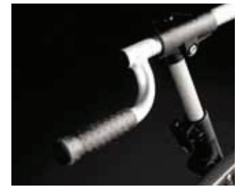
• Grip bar with universal grips for grip width reduction