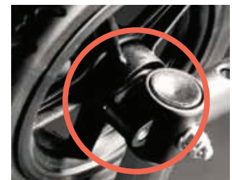
• Friction brake at the rear wheels