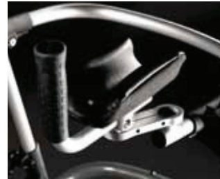
• Grip bar with forearm supports and vertical hand grips