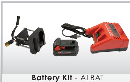
Battery Kit - ALBAT