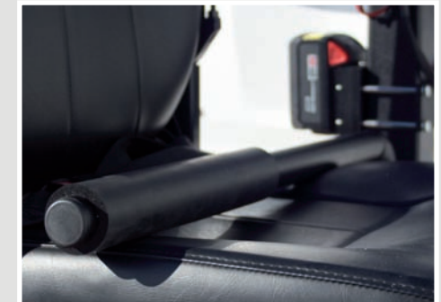
Automatic Hold-down Arm