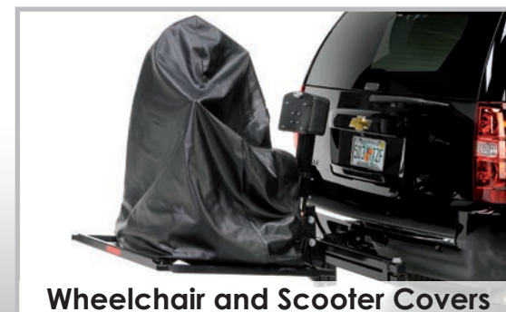
Wheelchair and Scooter Covers