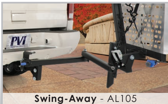
Swing-Away - AL105