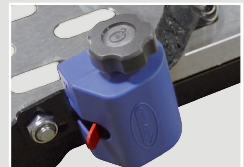
Q'Straint Retractable Hooks