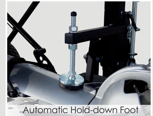
Automatic Hold-down Foot