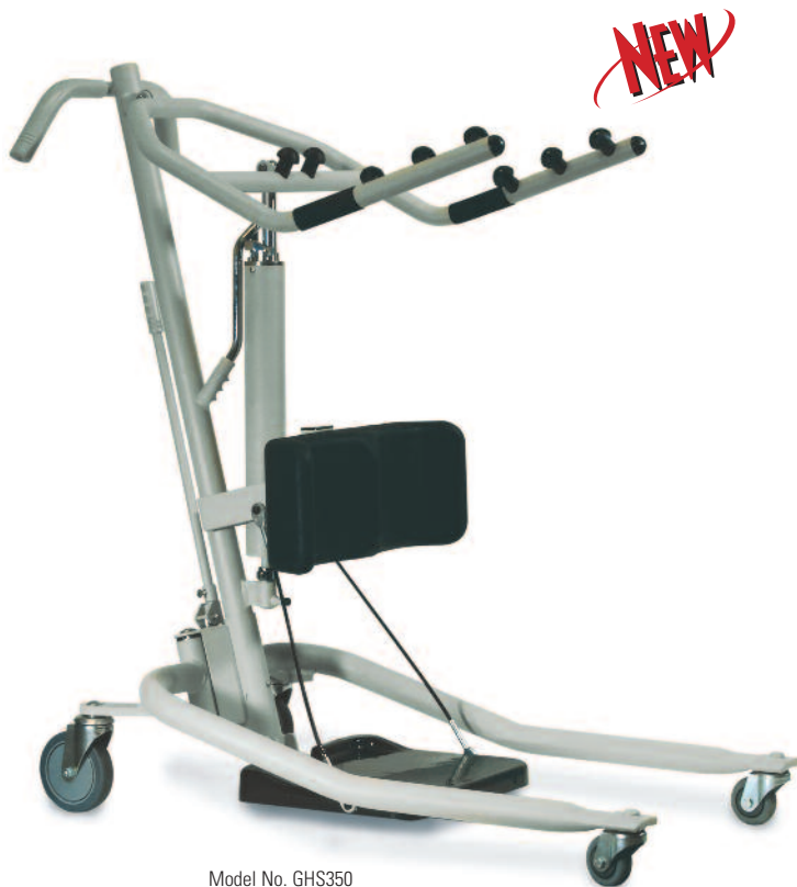
Model No. GHS350

Comfortable and secure, the Invacare® Get-U-Up™ stand-up lift is the answer to your patient transfer needs. Its ergonomic styling and easy maneuverability make the Get-U-Up an ideal product for every day patient handling. The Get-U-Up helps ensure caregiver security and patient peace of mind. Ideal for use with partial weight-bearing patients as well as those needing rehabilitation support, the Invacare Get-U-Up stand-up lift offers safety, comfort and stability.