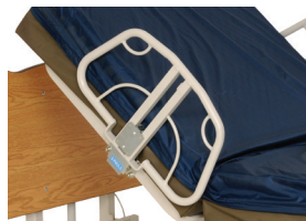
1/4 Length Side Rail