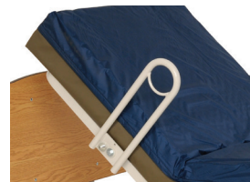
Pivoting Assist Bars