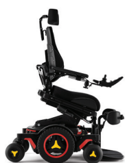
Anterior tilt adjustment