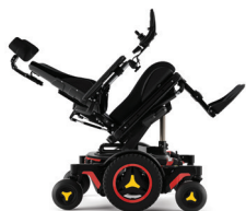
Posterior tilt adjustment