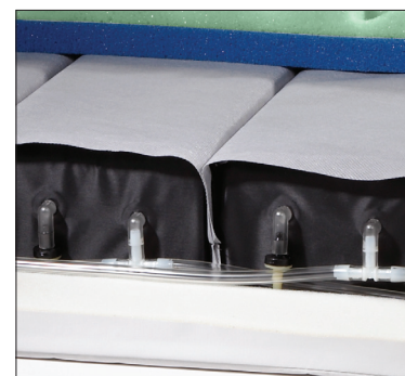
Dynamic pressure delivery system utilizes a vent and check valve system to automatically and precisely adjust the support characteristics.

For more information or to place an order, call 800-474-4225 ext. "0"