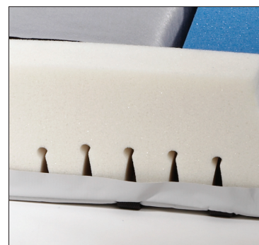
Articulation slots allow mattress to bend with the bed frame.