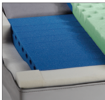
In addition to the heel slope, special custom cuts in the foam redistribute pressures in the critical heel section.