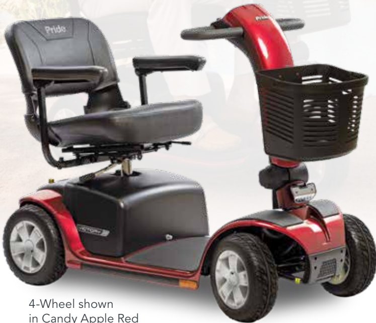
4-Wheel shown in Candy Apple Red