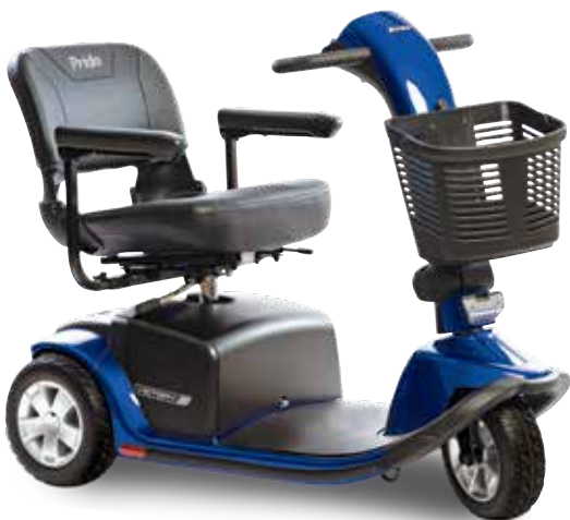
3-Wheel shown in Viper Blue

The Victory ® 10 series offers added style, comfort and performance for your active lifestyle. Standard features include LED pathway light, LED battery meter, feather touch disassembly, wraparound delta tiller, 10" solid tires and a front basket. A 400 lb. weight capacity, a per charge range of up to 16 miles and a maximum speed up to 5.3 mph compliment the versatility of the Victory 10. Available in Viper Blue and Candy Apple Red.